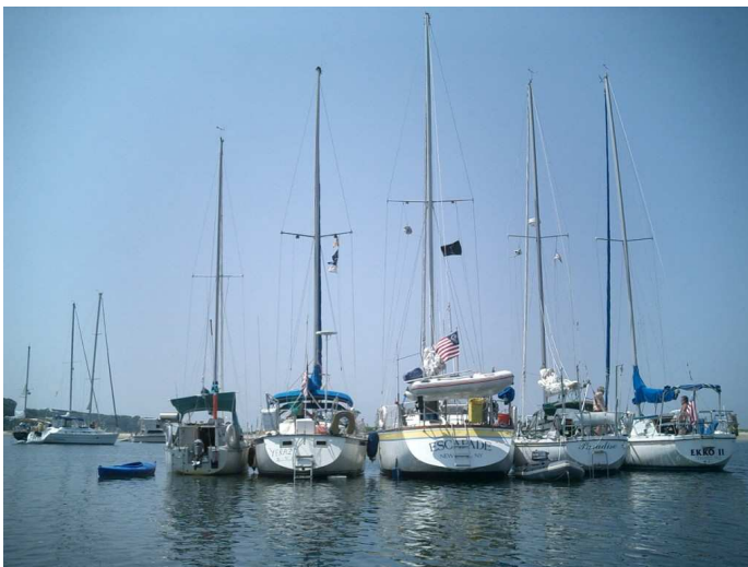
The Sand Hole, July 4, 2006