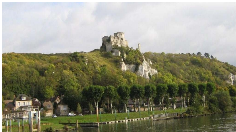
Along the Seine

Rhone. In Vienne, a Roman theatre still seats 13,500 but for concerts. And the surprise in Arles, made famous by Van Gogh, was the Roman coliseum, still seating 30,000 -- for bull fights. Arles was built up by Caesar because their shipbuilders helped him conquer Ptolemy. The famous 12 th c. bridge at Avignon is still very much worth seeming even though it is only 1/4 its original 3000 ft length due to the strong river currents and floods of the Rhone. Wine tastings and French food of course enhanced our