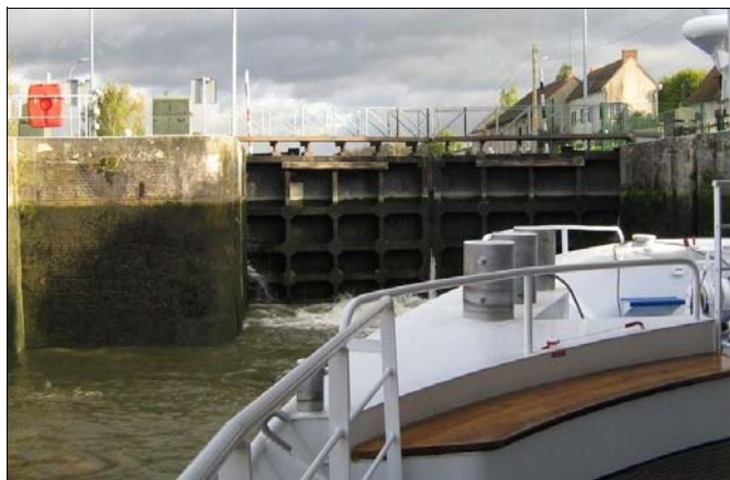
River barging in France