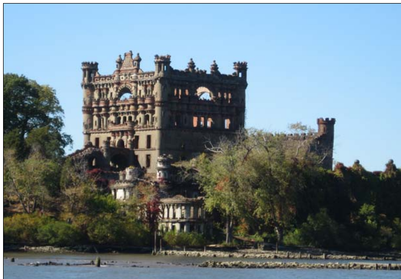
Bannerman's Castle along the Hudson River