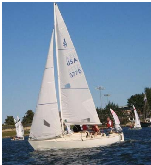
J-24's at Ft. Schuyler

Regatta . At the end of four short races, we came in second. I did a little wind strategizing in the one race, where we came in first. Great Practice! Malcolm and I were crewing in the boats belonging to the college's sailing program and, prior to the event, we set up the sails in the pre-race