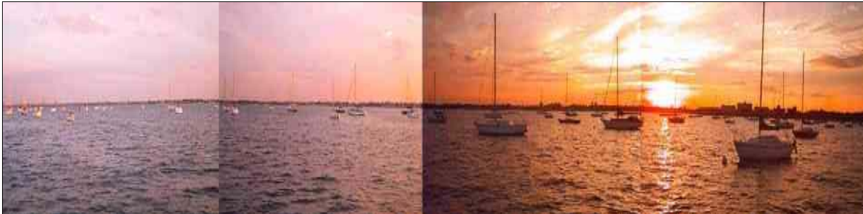
The view of Eastchester Bay from the dining room

The Stuyvesant Yacht Club, home club for many of our founding members, has an excellent dining room, a dance floor, and a great view. Starting at 6:30 PM, there will be a social time with hot and cold hors d'oeuvres, a cash bar, a buffet dinner with choice of fish (salmon with dill sauce), chicken (chicken française), meat (pork loin with rosemary) and pasta (lasagna with vegetables) and mixed salad, side dishes and desserts. There will be music for conversation, or dancing, and a tune or two by various club members as the new slate of officers take up their posts. Please clip the coupon below and return it to Susan Wheeler. You may call her at (212) 879-4991